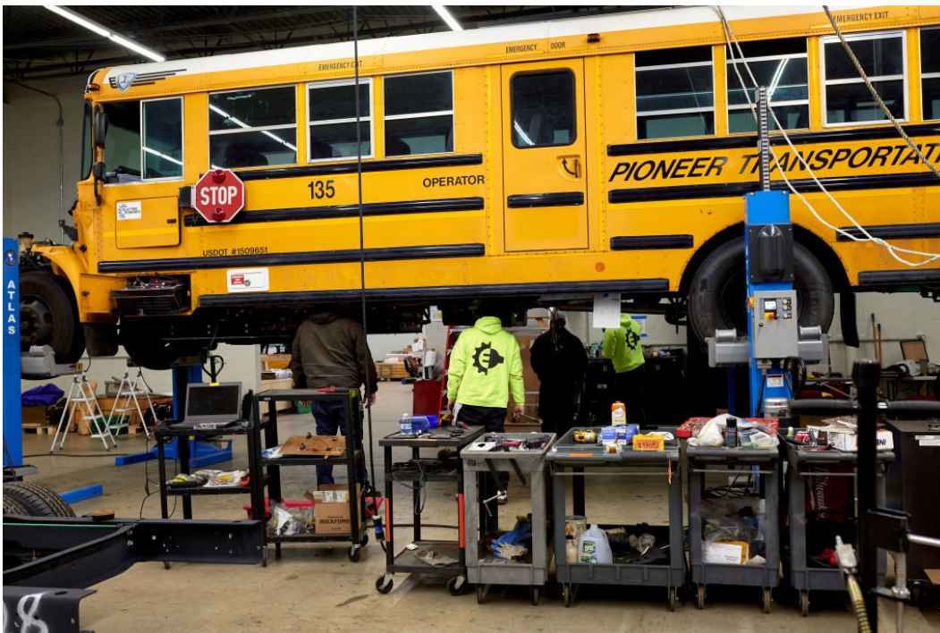
Workers convert a diesel school bus into an electric school bus at the Unique Electric Solutions facility in Holbrook, New York, US, on Wednesday, March 22, 2023.

The Seattle area will be getting $33.5 million to purchase 30 electric battery buses and chargers.